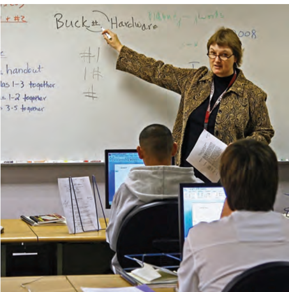
College was out of reach for most Bridgeport students before the school board started this program.

BOARD MEMBERS BELIEVED THAT, IF STUDENTS HAD THE OPPORTUNITY TO EXPERIENCE SUCCESS IN A COLLEGE COURSE IN THE SAFETY OF THEIR HIGH SCHOOL ENVIRONMENT, THEY WOULD BE ENCOURAGED TO ENROLL IN OTHER COLLEGE CLASSES.