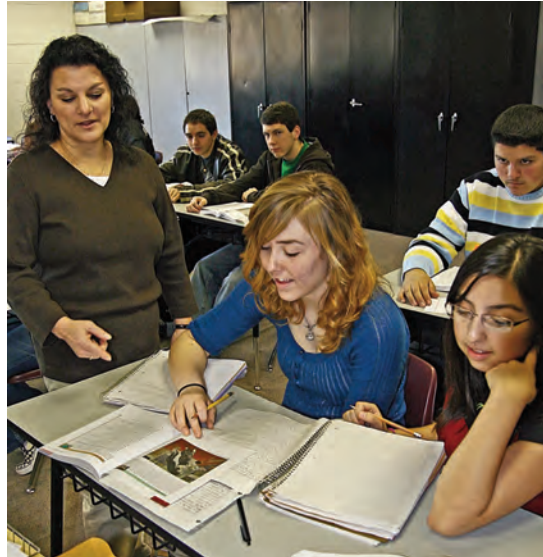
Scores on state assessment tests have soared since the program started in 2003.

The academic rigor needed to pass such college courses led to a dramatic improvement in overall student achievement, as measured by the Washington State Assessment of Student Learning (WASL). In 2003, only 59 percent of students met the WASL graduation requirements in reading and 53 percent of students met them in writing. All seniors met WASL requirements in 2007 and 2008. Already, 78 percent of this year's sophomores have met the reading requirements and 87 percent have met the writing requirements to graduate.